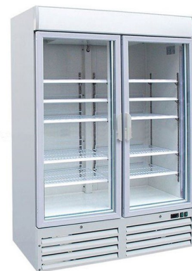
AGD920 shown with additional row of shelves. Dims (mm) : 1370w x 720d x 2090h