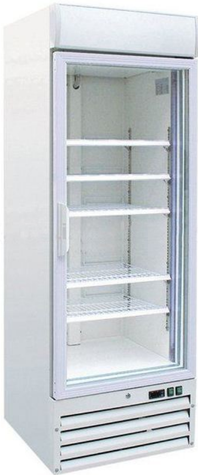
Pictured with additional row of shelves