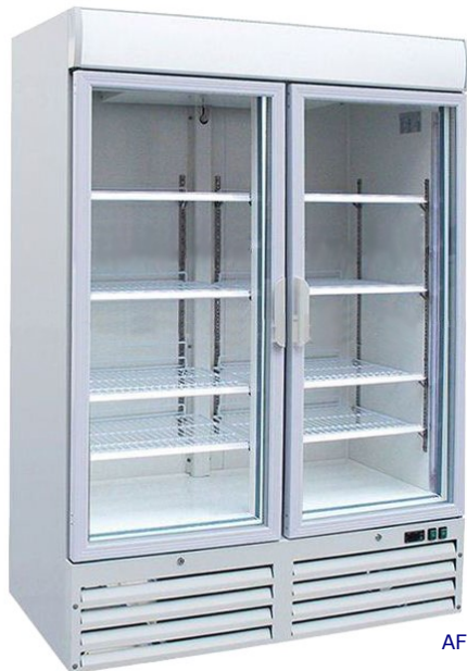
AFD920 & AFD930