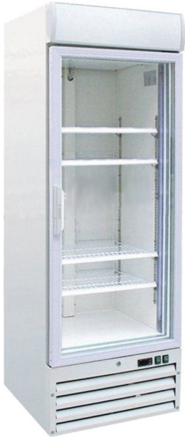
AGD420 & AFD420